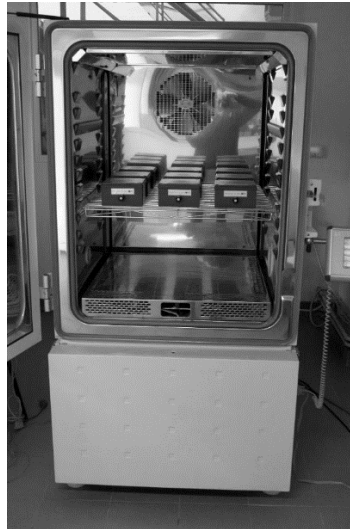
Fig. 3 Climate chamber used for conditioning of test samples

For example, in case of an equipment, designed for use at ambient temperatures between -30^{\circ}\text{C} to +50^{\circ}\text{C} , having an enclosure made of plastic materials, the lower test temperature will be considered to be any temperature between -35^{\circ}\text{C} to -40^{\circ}\text{C} . In case the service temperature is determined to be 90^{\circ}\text{C} , the upper test temperature will be considered to be any temperature between 100^{\circ}\text{C} and 105^{\circ}\text{C} .