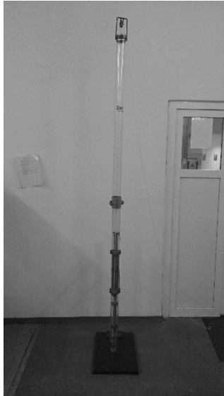
Fig.1 Test rig for resistance to impact test