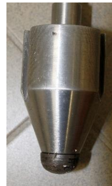
Fig.2 Test mass and impact head